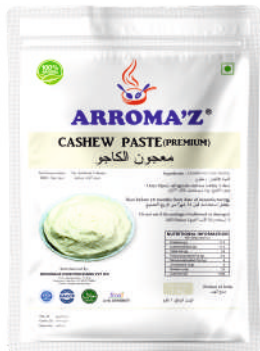
CASHEW PASTE (Premium)