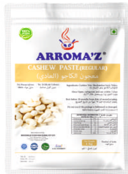
CASHEW PASTE (Regular)

PACKING: 01 Kg x 12 packs (Carton of 12 Kg)